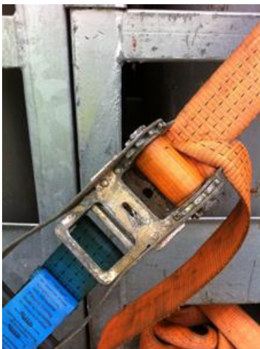
Strap in perfect shape 4t (see number of stripes)

Straps used must be at least 4t and in perfect shape.