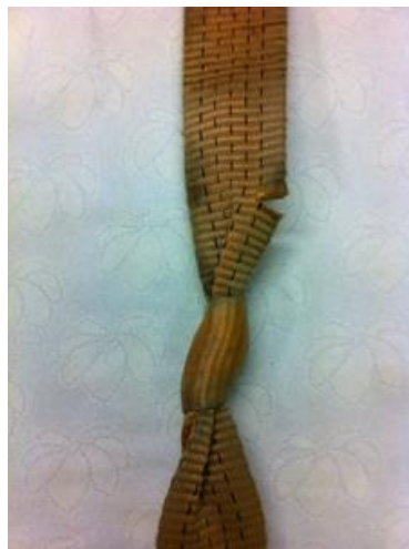
Strap with two defects 5t (see number of stripes)

On the following pages you will find examples of correct securing of units according to the Danish and Swedish rules. The last page shows examples of correct securing according to the German (increased) rules.